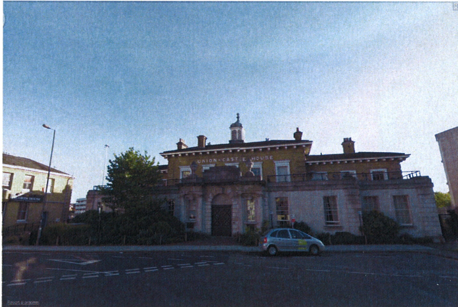
Union Castle House, Canute Road, Southampton, SO14 3FJ